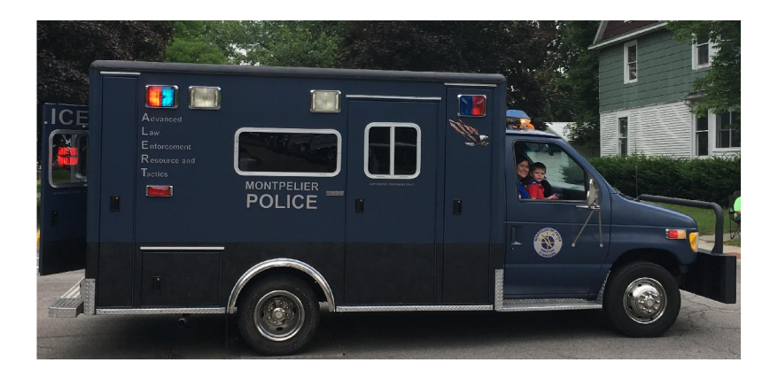
Strategy without tactics is the slowest route to victory. Tactics without strategy is the noise before defeat - Sun Tzu